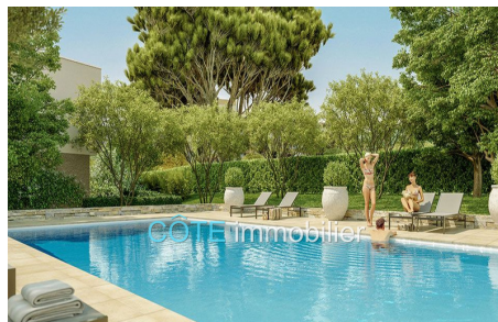
Programme neuf - Convention milancip - MLS Côte d'Azur