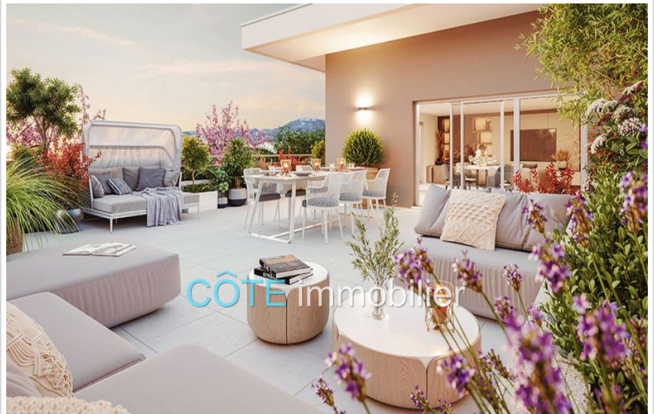
Programme neuf - Convention milancip - MLS Côte d'Azur

Document non contractuel 29/04/2024 - Prix T.T.C