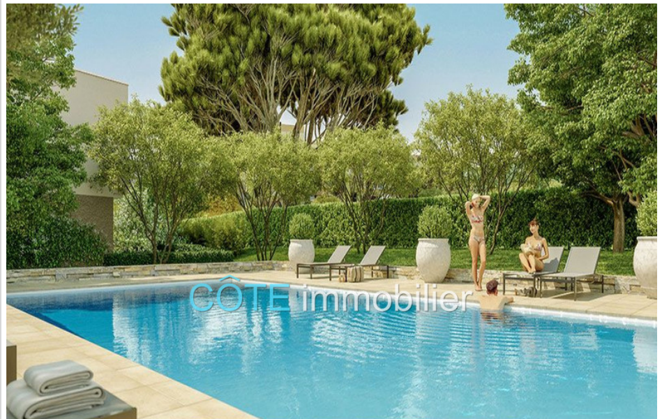
Programme neuf - Convention milancip - MLS Côte d'Azur