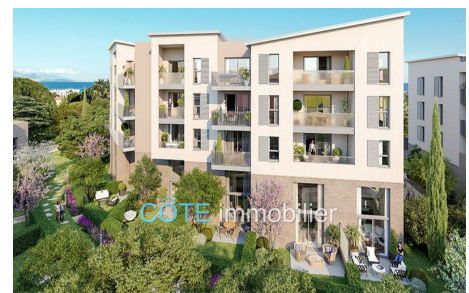
Programme neuf - Convention milancip - MLS Côte d'Azur