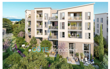
Programme neuf - Convention milancip - MLS Côte d'Azur